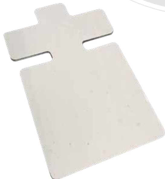
Junior Combo platen