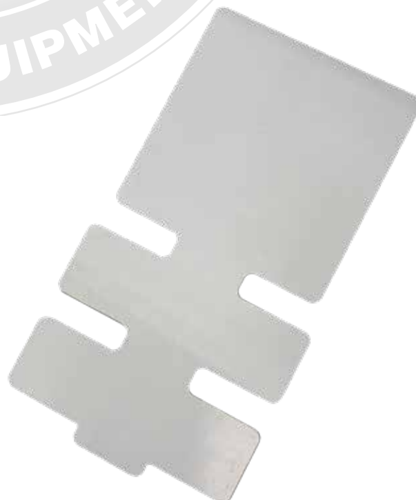
Senior Combo platen